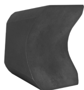
Blade type E

Data refers to the machine without options.